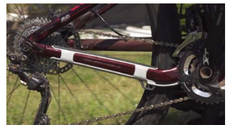
Trek's Objet500 Connex3 created this durable Digital ABS chain guard with rubber-like components in one print job.