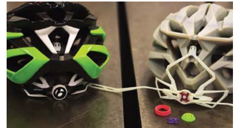
Trek's prototype development department uses multi-material 3D printing to achieve final-product realism.