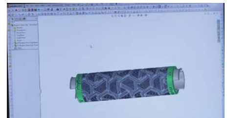
CAD model of an overmolded handlebar grip