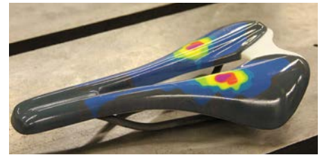
This color model shows the pressure that a rider puts on this seat.

"In order to make the best bikes here at Trek, we need the best tools. And Connex3 is the best tool for the job," says Zeigle.