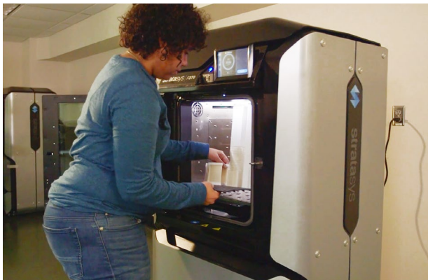
Accurate and reliable 3D printing helps students test their innovative ideas quickly.