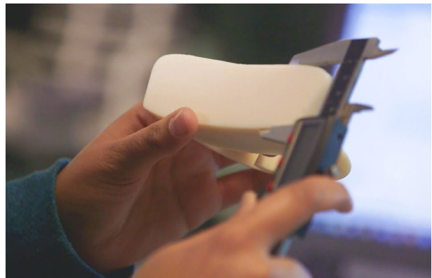
Students verify and refine their product designs with accurate, durable 3D printed prototypes.