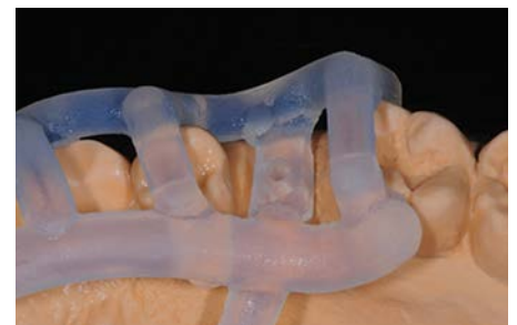
3D printed surgical guide on dental model prior to surgery.