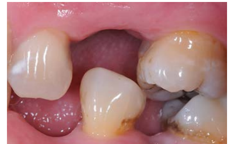
Photo showing the patient's mouth before surgery.