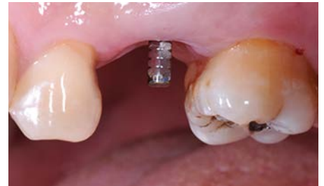
After drilling, the implant is placed into the patient's mouth.