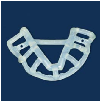
Surgical guide produced on a Stratasys 3D Printer.