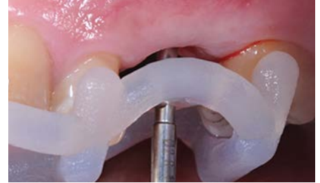
During surgery the guide pinpoints the location and angle for drilling.