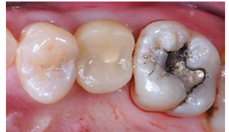
Photo showing the patient's mouth after surgery.