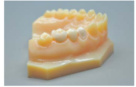
KTJ's 3D printer secures the perfect fit for each patient's individual dental anatomy and conditions.

"The Objet Eden260V has boosted our business with a streamlined modeling process and lower costs while making our customers happier. It's a big smile for everybody," said Shi.