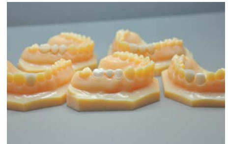
The Objet Eden260V 3D Printer helped eliminate fit issues and patient discomfort caused by inaccuracies in restorations.