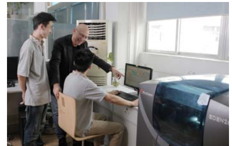
The ability to make quick adjustments to models significantly lowered KTJ's operational costs.