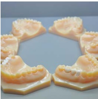
KTJ's in-house 3D printer streamlined the customization of dental models, a crucial aspect of digital dentistry.

The China market for dental prostheses has grown rapidly in recent years, reaching ¥4.35 billion in 2012. In order to remain competitive, KTJ Dental Technology Group is keen to employ technologies that shorten the production cycle, and produce custom dental models with greater accuracy and lower costs.