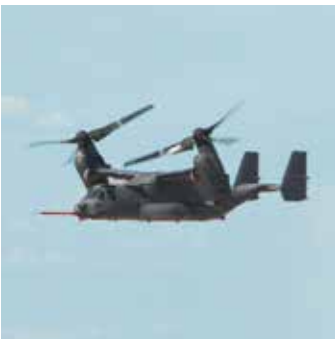
Bell Helicopter's Xworx prototyping lab used FDM to build functional models of communication-wiring conduit for the Osprey.