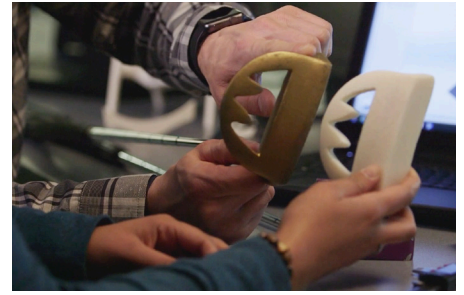
Students in Dunwoody's Engineering Drafting & Design program use the Stratasys F370 3D Printer to verify their golf putter design concepts.

At Dunwoody, 3D printing is more than just exposing students to prototyping. It's a powerful tool that teaches the problem-solving skills and collaboration needed to make them valuable assets in the job market. And the Stratasys F370 3D Printer makes that tool simpler and more cost-effective to use.