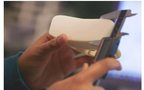
Students verify and refine their product designs with accurate, durable 3D printed prototypes.