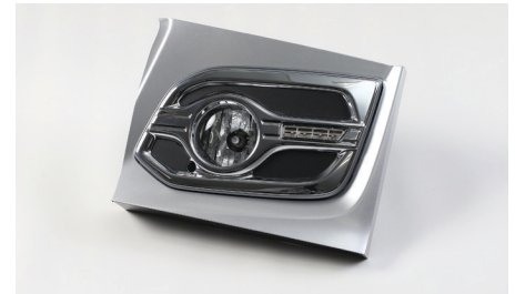
Final product of Fog light garnish