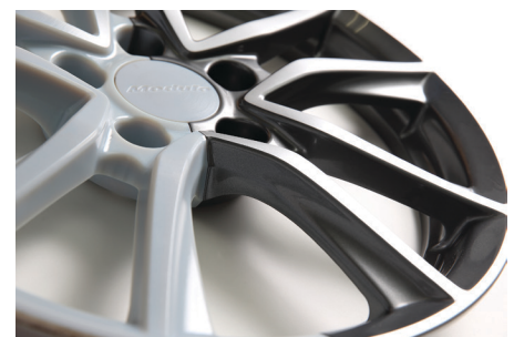
Wheel prototype model printed by Objet Eden500V: divided into few pieces and assembled.