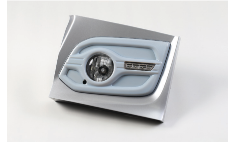
3D model printed by Objet Eden 500V