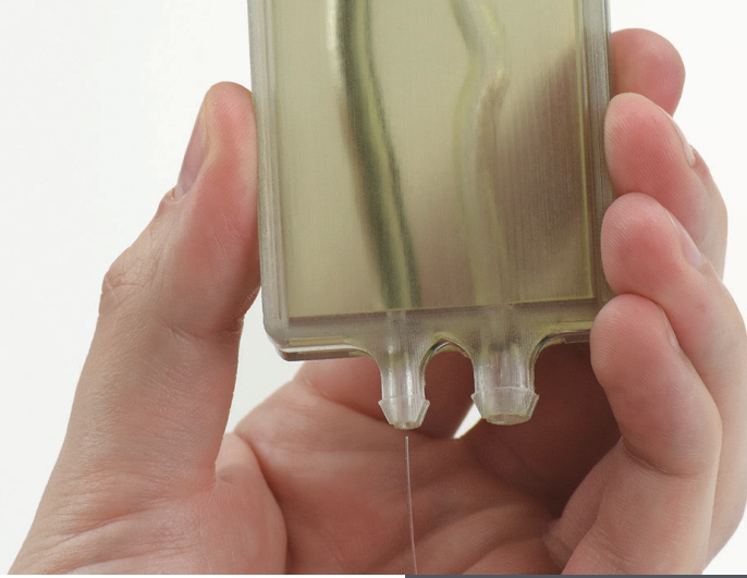
Peripheral model 3D printed using three different materials.