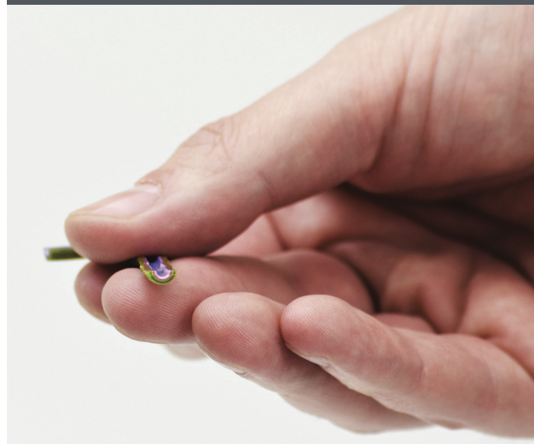
CSI's 3D printed lesion model that uses multi-colored, multi-textured materials.

Nick Ellering Cardiovascular Systems, Inc