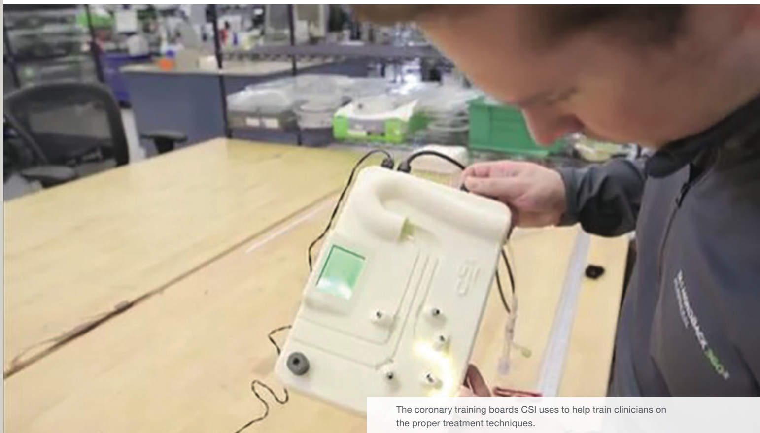
The coronary training boards CSI uses to help train clinicians on the proper treatment techniques.

“It's a great way to get instantaneous feedback,” said Draxler. “We've also experimented with multi-colored, multi-layered materials. As our device removes simulated lesion material, we can easily see and measure how far into the multicolored layers it's orbiting.”