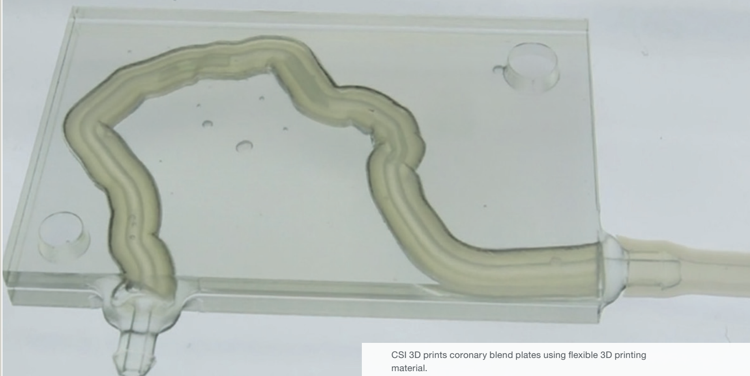
CSI 3D prints coronary blend plates using flexible 3D printing material.