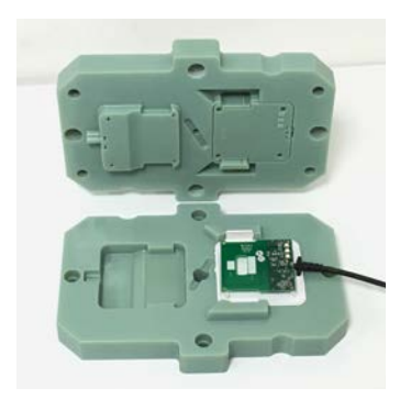
3D printed injection molds created in Digita ABS material.

A leader in the field of water-measurement solutions, the Arad Group (Arad) designs, manufactures and sells cutting-edge water meters to residential, bulk, irrigation and water-management companies around the world. The company manufactures more than 500,000 units a year, and operates an in-house manufacturing plant using a sophisticated testing and quality-control method.