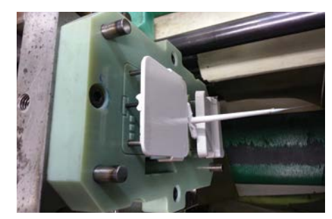
Injection molded part being ejected from 3D printed mold.