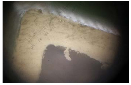
Microscopic image of the welding area