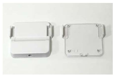
Injected parts from 3D printed molds.