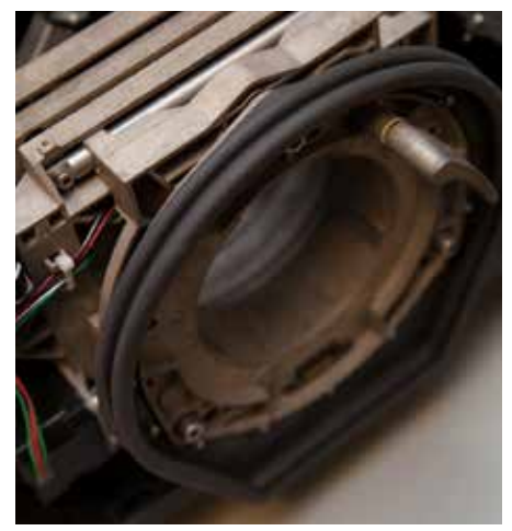
Lens mount boot with rubber-like properties