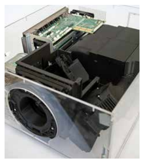
This mockup projector has a combination of 3D printed and production components.