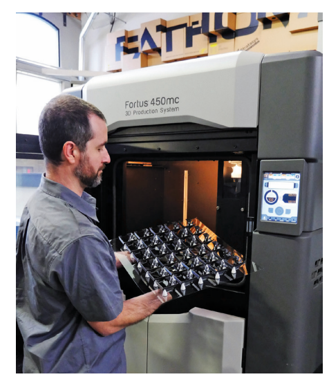
FATHOM, an advanced manufacturing facility, has utilized 3D printing since its inception