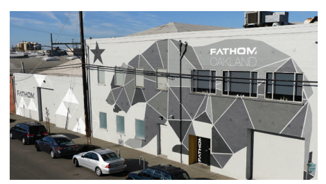
The Oakland, CA, base of FATHOM Industries

With the Continuous Build 3D Demonstrator, a total disruption of the supply chain is possible for just-in-time parts. "Customers can request what they need in their MRP system when they need it and inventory is available on time, every time, justin-time."