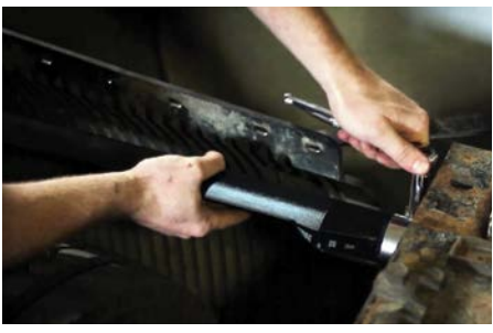
ULTEM's rugged qualities make it useful in environments where axle grease, oils and road grime are pervasive. The new black color helps it blend right in.

Check out video footage of Minimizer testing its super-single fender assembly in black ULTEM at Stratasys.com/blackULTEM.