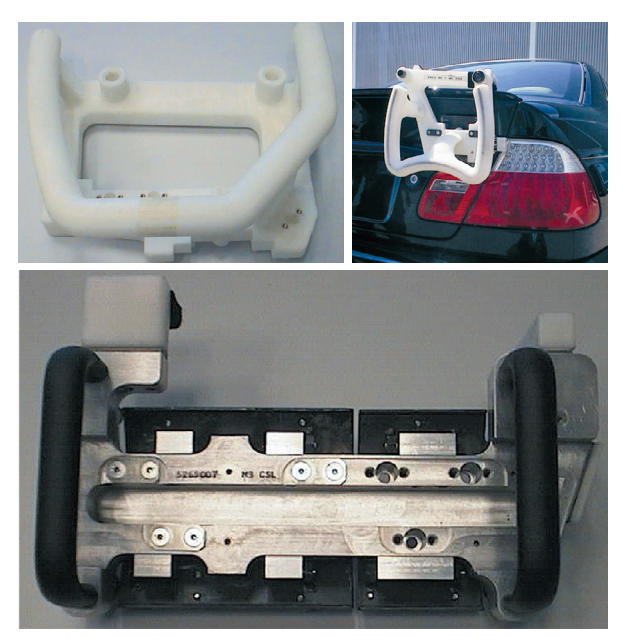
Figure 1: Three devices for attaching the model badge at the rear of the vehicle

The weight of a device is an ergonomic criterion as well. Devices that are carried and operated by people may not exceed a weight of 5 kg (11 lbs.).