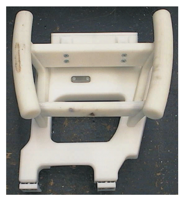
Figure 3: Complex and Organic Shape of a Production Tool