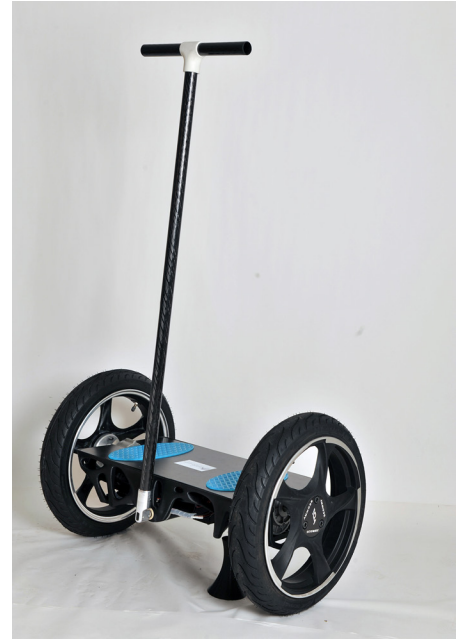
The finished self-balancing scooter designed and manufactured by the University of Applied Sciences Ravensburg-Weingarten.