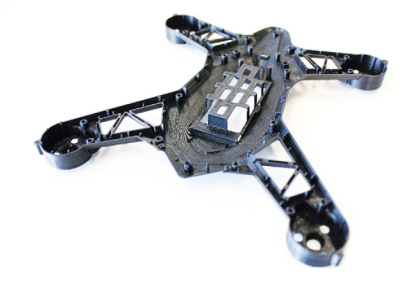
Toy State design team 3D printed frame of a drone with high precision and strength using PC-ABS material.

"The future is here," Nickless said. "Things are more digitized than ever before, and we need to keep up, not just to stay on schedule but also to stay competitive in the market. Without 3D printing, we would have trouble providing timely sales samples to our customers. Stratasys provides us with just the right tool and we are grateful for that," concluded Nickless.