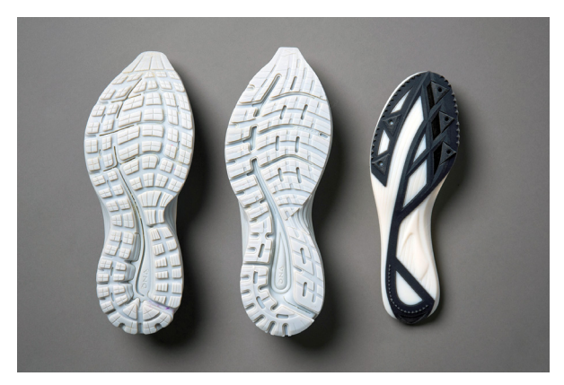
Brooks' 3D printed mid-sole and out-sole prototypes.

process, the company also saves $500 to $800 per shoe design.