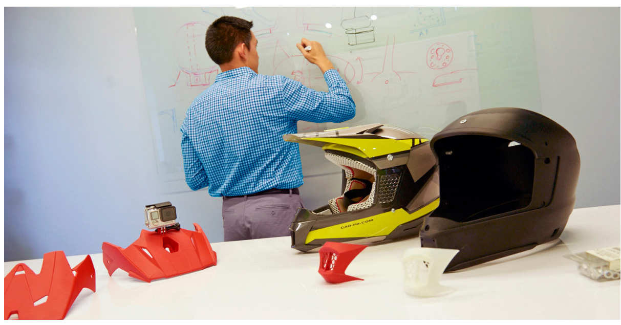
From left to right, the helmet camera mount, final helmet, mouthpieces in red and white, and the helmet prototype at CAD.