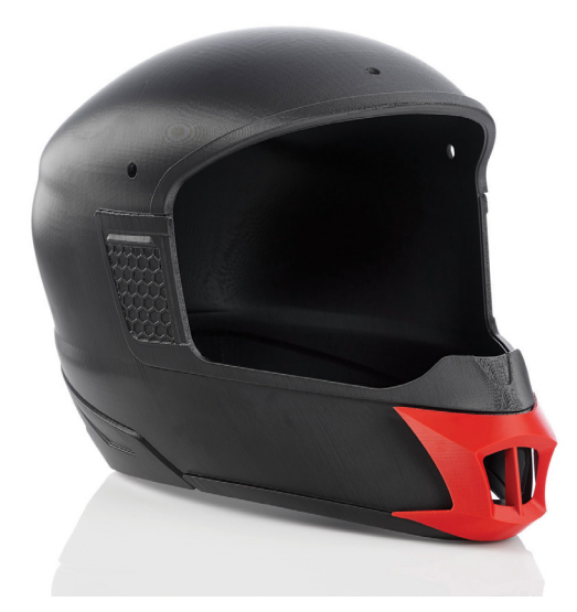
The helmet prototype was 3D printed in one build on the Stratasys F370.

While outsourcing 3D printing might result in models equal in quality to those 3D printed in house, there are benefits of investing in your own machine. A highly iterative process can only happen in a feasible time frame when engineers can see quick feedback on design changes. In house 3D printing eliminates shipping delays and reduces administrative slowdowns that can accompany sourcing prototypes from external services. With some systems, one in-house