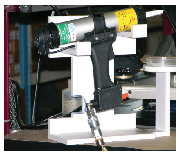
When machined fixtures were quoted at $12,000 and seven days, Thermal Dynamics opted to make them with FDM to save $10,000 and several days.

HOW DOES FDM COMPARE TO ALTERNATIVE METHODS? $10,000 $12,000 $2,040 $616 THOGUS THERMAL DYNAMICS $2.550 $176 $525 JOE GIBBS BMW RACING Lead-time reduction Cost savings with FDM 40-90% with FDM 70-90%