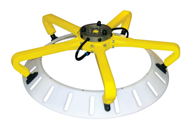
By using additive manufacturing to recreate a gripper with internal vacuum channels, Digital Mechanics eliminated five external hoses that hampered operations.