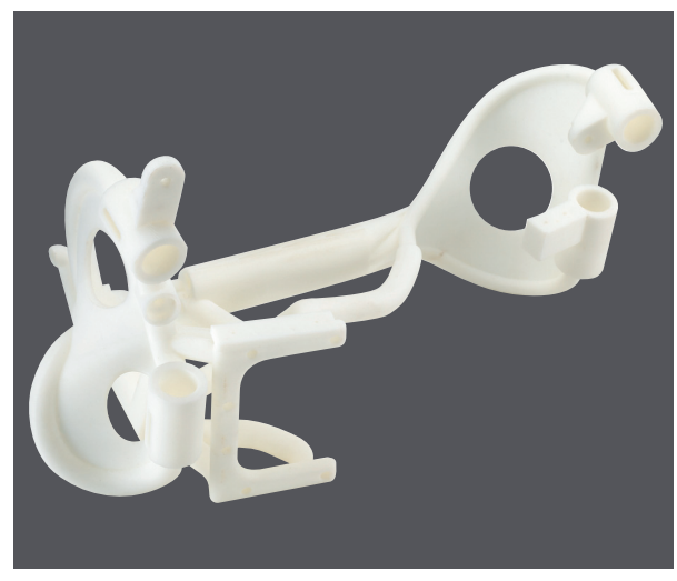
This ergonomic and lighter BMW hand tool reduced worker fatigue.