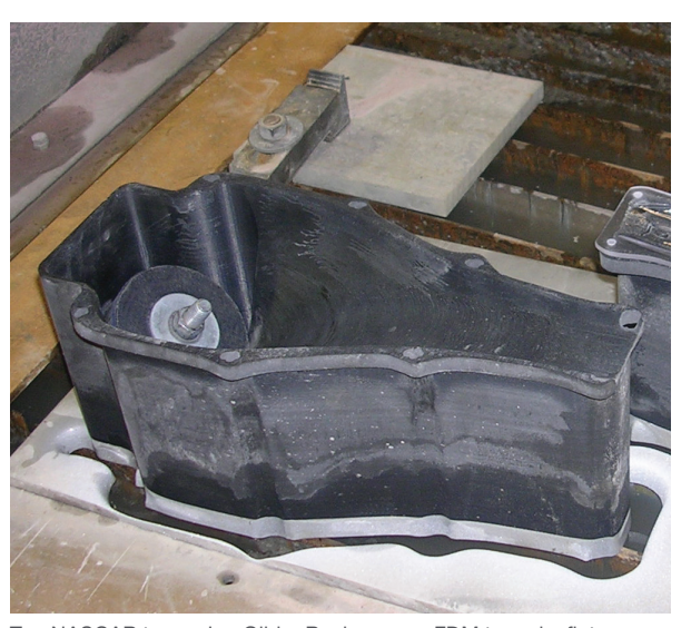
Top NASCAR team, Joe Gibbs Racing, uses FDM to make fixtures, some of which have been in service for more than two years and have cut lead time and expense by an average of 70 percent.

Making the tool fabrication process faster and more affordable, AM will increase the number of jigs, fixtures and other manufacturing tools, which will improve the bottom line. AM can also optimize manufacturing tool performance for operational functionality. Before AM, designs that