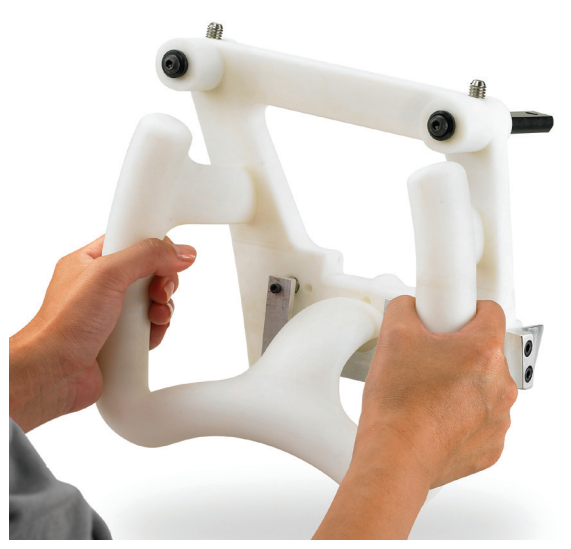
Using FDM, BMW prints jigs and fixtures that would not be possible with conventional machining and fabrication. AM allows them to be easier to use and more functional.