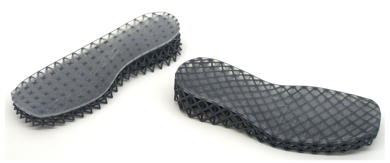
DManD researchers created multi-material soft-lattice structures for this footwear prototype using a custom design, analysis and slicer tools to spatially control stiffness and non-linear