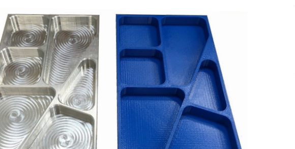
Figure 1: CNC (aluminum) on the left, 3D printed (plastic), right.

As will be shown later, CNC gains the time advantage because of the simplicity of the pocket tray's design.