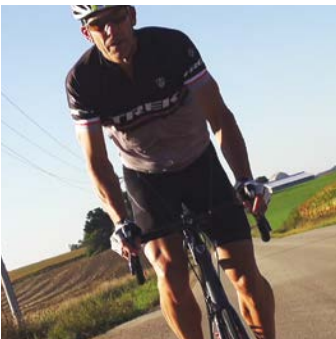
Road-inspired innovation helps Trek lead its industry.

Think of your bike. How many materials does it represent? A rigid metal frame, firm rubber tires, soft handlebar grips, a cushioned seat, clear and colored lenses — a lot of engineering and testing go into a smooth, fast ride.