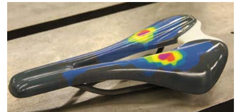
This color model shows the pressure that a rider puts on this seat.

"In order to make the best bikes here at Trek, we need the best tools. And Connex3 is the best tool for the job," says Zeigle.