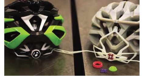
Trek's prototype development department uses multi-material 3D printing to achieve final-product realism.