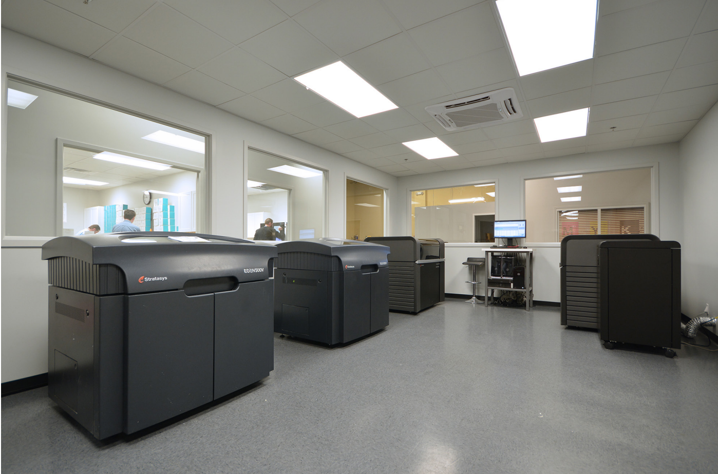
The DynaFlex dedicated 3D Printing Center, with space for two additional J700s.