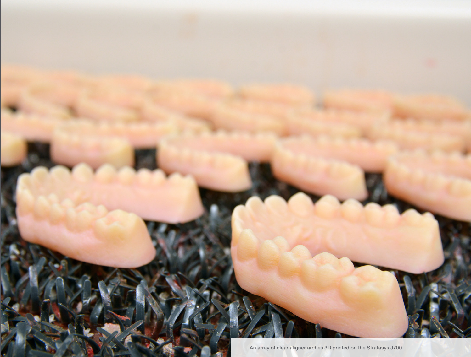
An array of clear aligner arches 3D printed on the Stratasys J700.