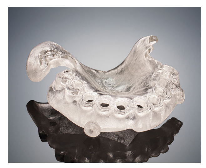
Figure 5. VeroGlaze, left, produces functional dental veneer try-ins, while Bio-compatible, right, is approved for direct skin and short-term mucosal-membrane contact.