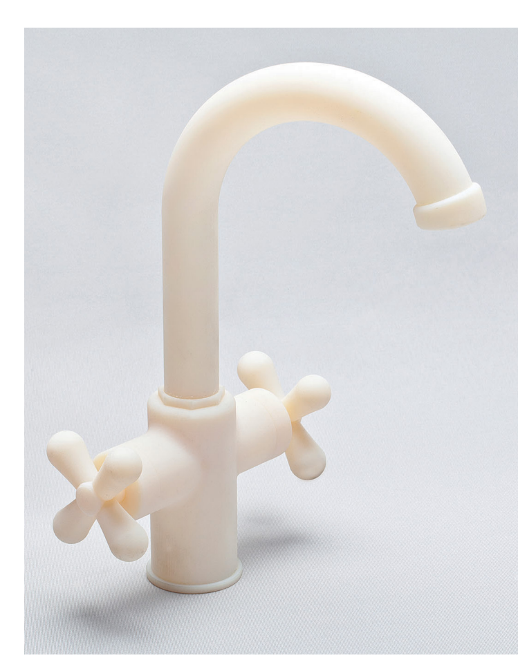
Figure 6. High Temperature material can withstand hot fluids.

High Temperature is a wise choice for functional testing with hot air or water, such as evaluations of plumbing fixtures and household appliances (Figure 6). Temperature resistance may also be a consideration for show pieces that will endure intense, hot lights. If temperature isn't a consideration, High Temperature may be a good choice for prototypes that need very high stiffness and strength.