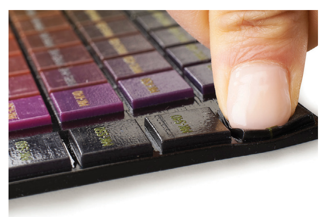
Figure 8. Various colors and Shore A values are displayed on this palette.

This range of rubber-like properties is unrivaled in the 3D printing industry. With it, designers and engineers can match the flexibility of production elastomers or test a number of slightly different options to find just the right feel (Figure 8).