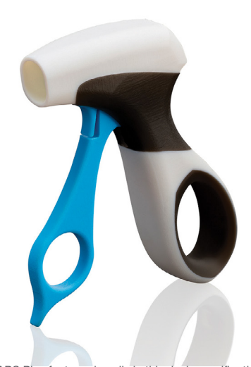
Figure 7. Digital ABS Plus features heavily in this design verification prototype for medical devices. This surgical prototype also features Agilus30 overmolding in black for superior grip and a 3D printed color handle, printed separately. Digital ABS Plus has heightened impact strength from Digital ABS, leading to improved functional performance.

Digital ABS Plus extends the simulation of engineering thermoplastics beyond the thermal resistance, toughness and transparency of High Temperature, Rigur and VeroClear. Digital ABS Plus is an advanced version of Digital ABS™, improving on the original material's impact strength. As its name indicates, this material closely approximates ABS. Compared with the averages for ABS¹, Digital ABS Plus has the same or higher values for strength, flexibility, durability and heat resistance. Its impact resistance is below average for ABS¹ but still within the range of all ABS offerings, and more than three times that of Vero.