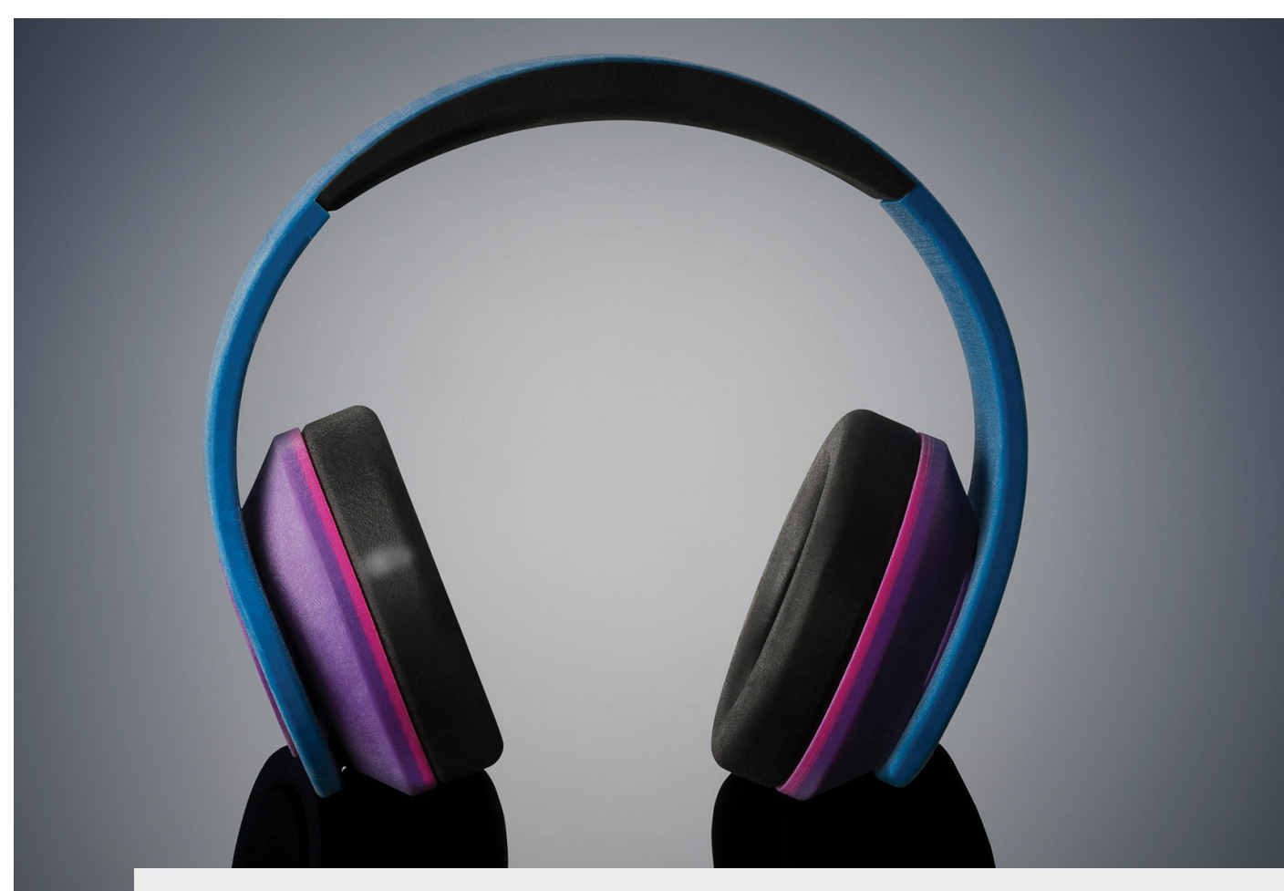
Figure 4. The rubber pads on these headphones have a soft Shore A value of 27. The full model was 3D printed in one piece.