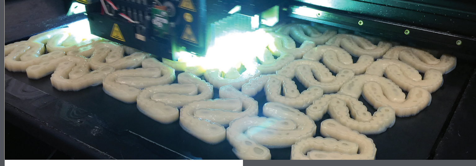
Protec Dental Lab's 3D printer in action