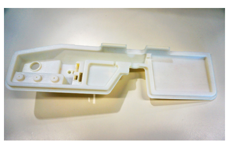
The third design is considerably longer as aesthetics are introduced.