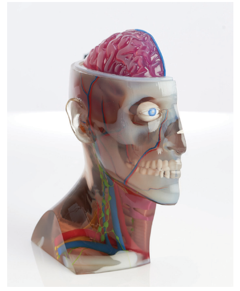
The head and brain model uses transparent materials to reveal internal tissues.