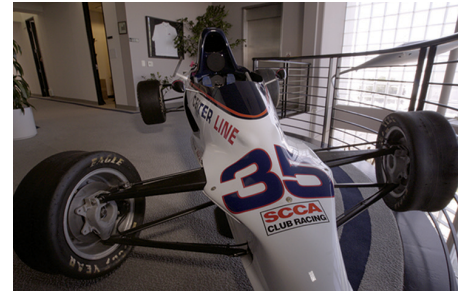
Swift has a long heritage of developing next-generation composite parts for motorsport applications.

Depending on part complexity and size, the tool build can take just days to produce, and frequently less than 24 hours. This, compared with the traditional four to six weeks, or even months, for a machined or cast wash-out tool assembly, affords Swift unprecedented levels of flexibility. These time savings not only permit Swift to meet the increasing demands of shorter client lead times, but also allow much greater design freedom and product iteration cycles that result in innovative part performance and functionality.