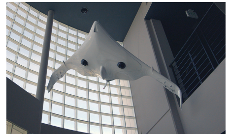
Swift uses composite parts for innovative aerospace applications to reduce weight.