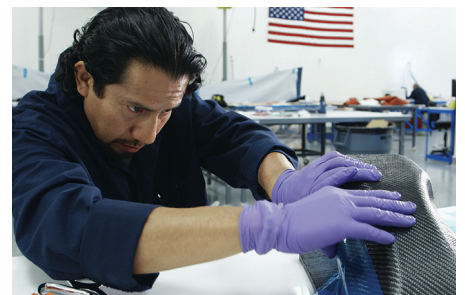
Prior to bagging for cure, the ply lay-up is completed.