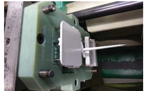
Injection molded part being ejected from 3D printed mold.