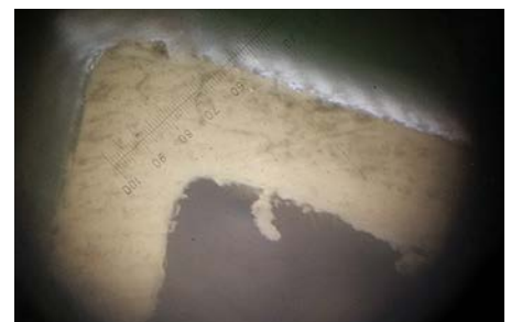
Microscopic image of the welding area