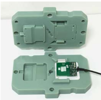
3D printed injection molds created in Digital ABS material.

A leader in the field of water-measurement solutions, the Arad Group (Arad) designs, manufactures and sells cutting-edge water meters to residential, bulk, irrigation and water-management companies around the world. The company manufactures more than 500,000 units a year, and operates an in-house manufacturing plant using a sophisticated testing and quality-control method.