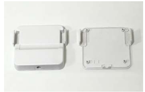
Injected parts from 3D printed molds.

By using 3D printed injection molds to produce functional prototypes, Arad has reduced its time to market by five weeks, and its prototype production costs by 80 percent.