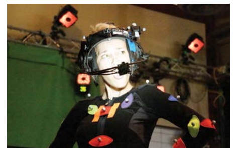
MOCAP's success with helmet-mounted cameras has helped expand its business into new entertainment products.