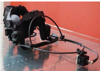
Motion capture devices mounted on helmets, like this one by MOCAP Design, produce high-quality facial movements for the entertainment industry.