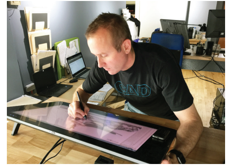
CAD specializes in creating complex surface geometry for the plastics industry.

Features of the Stratasys F370 like its minimal setup, fast-draft mode and auto-calibration ensure less time troubleshooting and more time for the team to tackle the next complex design.