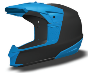
Render of CAD's helmet redesign highlighting a new camera mount, neck brace piece and mouthpiece in blue.