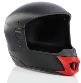
The helmet prototype was 3D printed in one build on the Stratasys F370.