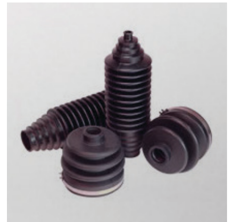
The company purchased the Objet500 Connex to broaden its rapid prototyping capabilities.