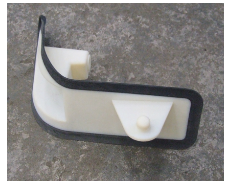
More than 2,500 single and multimaterial prototypes have been produced to date.