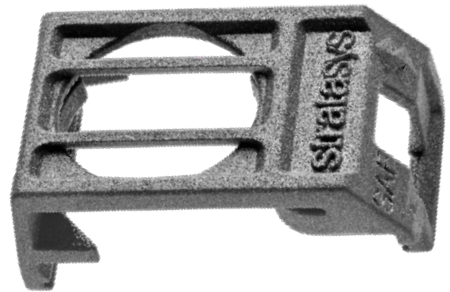
Circuit Board Bracket

Time to part is also a challenge that the Origin One 3D printer is designed to successfully overcome. Lead times for polymer molding can take weeks or months. But by implementing leading-edge P3 technology, users can achieve a mold-like surface finish in a fraction of the time. This means businesses looking to launch production as quickly as possible can rely on the Origin One printer for short runs for testing as well as product launches. Additionally, when a part shortage hits or lead times increase, flexible production with Origin One can provide short-term fixes or long-term solutions for manufacturing businesses.