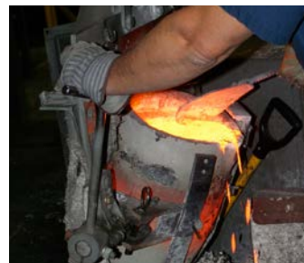
Pouring molten metal.