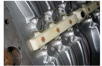
A matchplate with an interchangeable FDM gate and runner system.