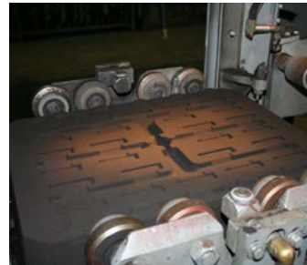
Sand mold created from FDM pattern.