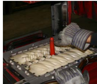
Matchplate with FDM insert in molding machine.

The most common approach is to produce patterns using computer numerical control (CNC) machining, but the production costs are high and the lead time is substantial. Problems like incorrect shrink compensation and design flaws generally require that the pattern be reworked which adds to the expense and lead time.