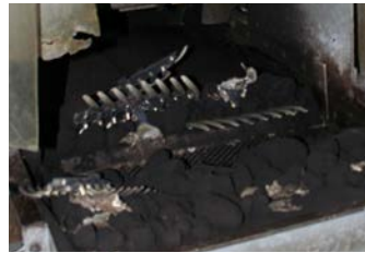
Shakeout removes sand from casting.

Melron then decided to investigate FDM. They started on a small scale by ordering an FDM matchplate from a service bureau. Then, because it worked so well, the company ordered a Stratasys® FDM printer and began producing matchplates that combined pre-fabricated aluminum blanks with FDM inserts.