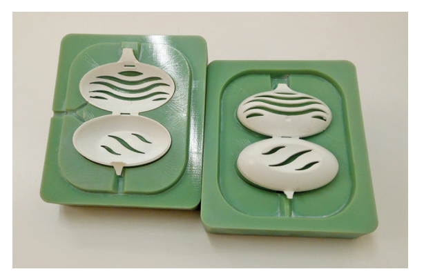
Unilever 3D printed injection mold for Domestos rim block.

The 3D printed replicas offer researchers, scholars and the general public wider access to historic artifacts. Not only can they be restored and recreated, the artifacts can also be used for educational events and traveling exhibitions.