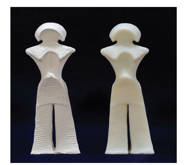
The 3D printed Jomon Goddess sculpture replica (right).