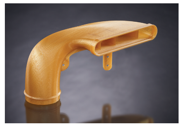
A 3D printed air intake using ULTEM<sup>™</sup> 1010 resin.

Airbus, a leading aircraft manufacturer, uses 3D printed parts in place of traditionally manufactured parts to increase supply chain flexibility and meet delivery commitments.