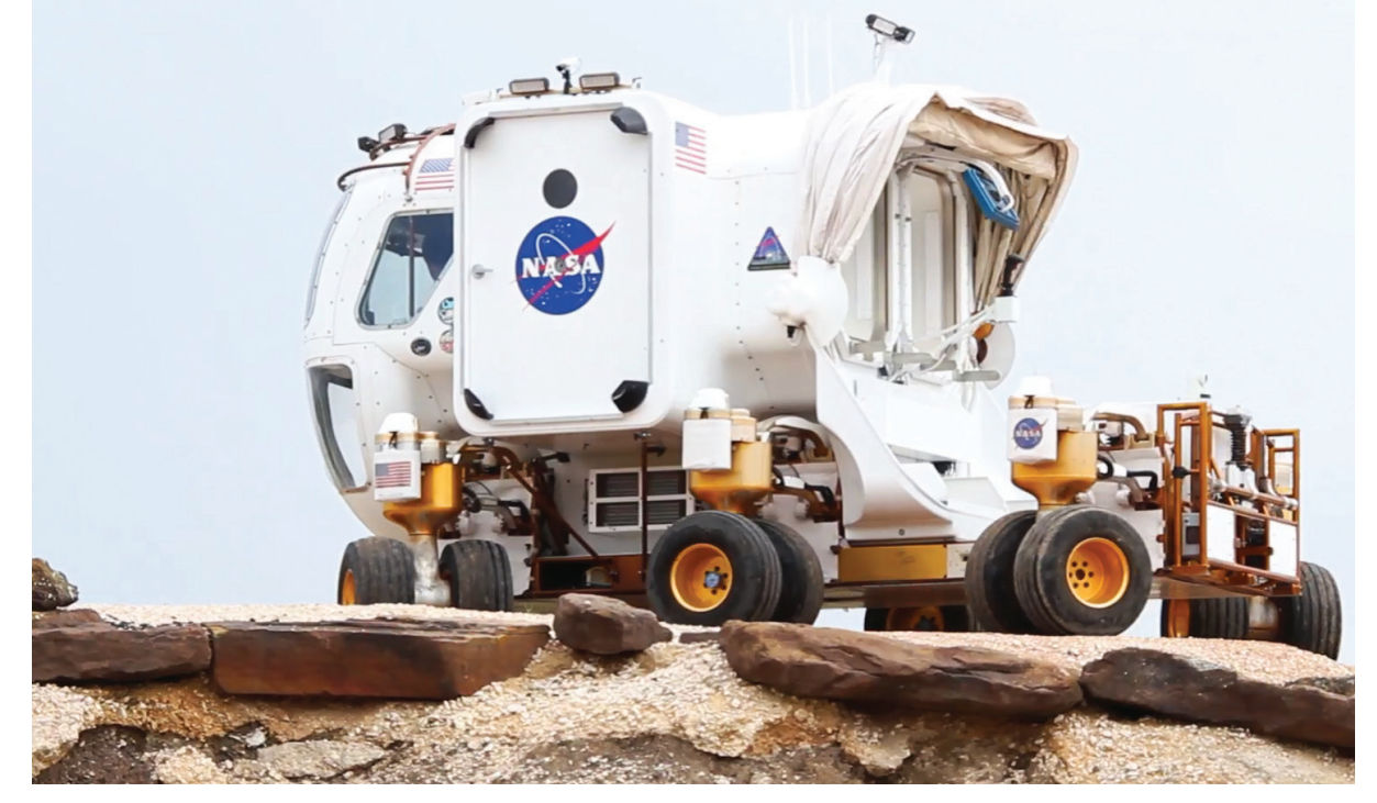
NASA installed 3D printed parts on their Mars rover concept vehicle.

Material complexity: The ability to create new materials on the fly, to create meta-materials that will mimic natural materials, will drive the 3D printing revolution. Our limited capacity to model, simulate and predict properties of such new materials restricts our ability to develop them.