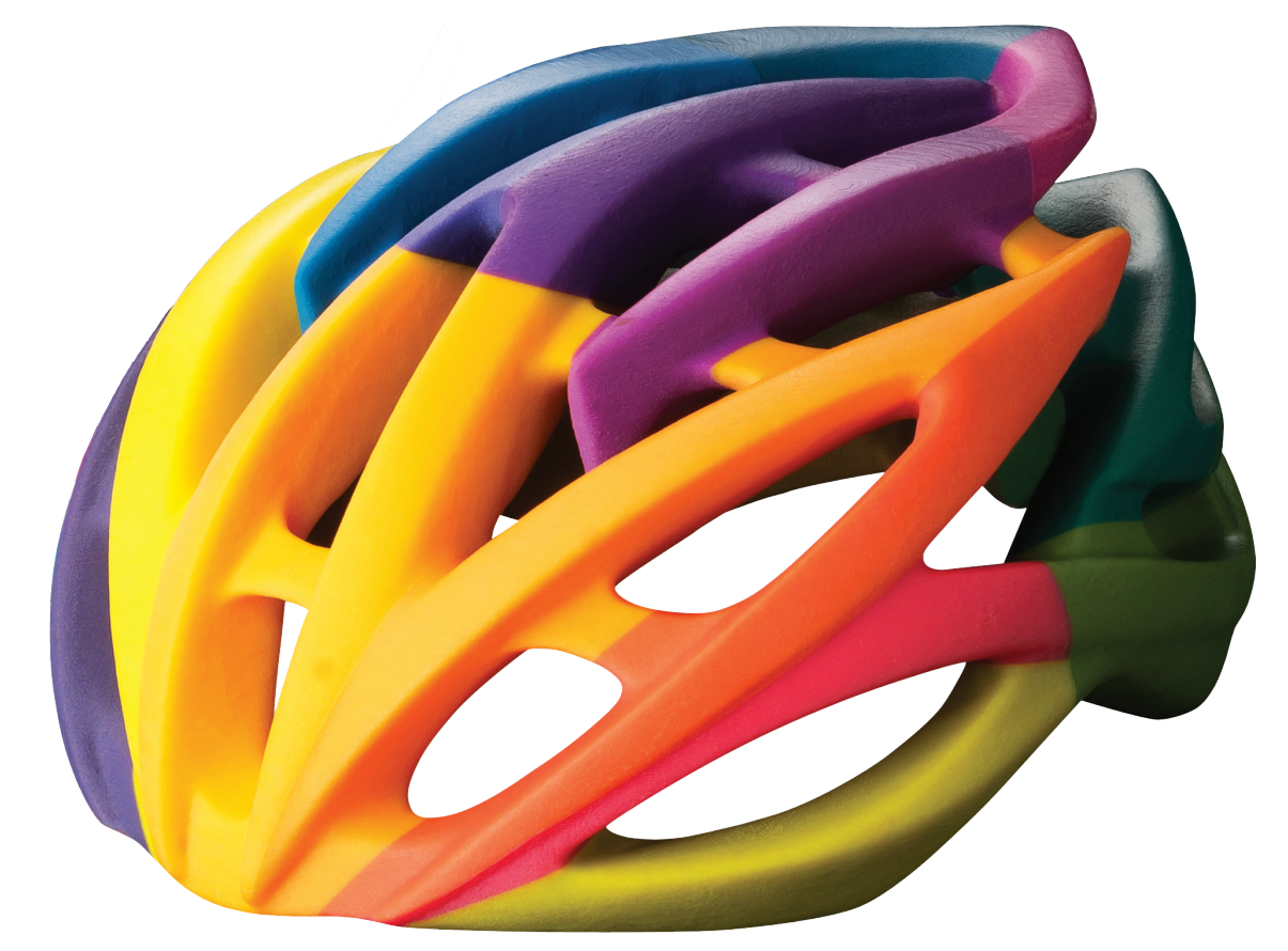
Trek's 3D printed color helmet prototype.

PolyJet technology offers the unique ability to print parts and assemblies made of multiple materials. Parts with different mechanical and physical properties, smooth, durable surfaces and exceptionally fine details are possible, all in a single build. The system can print living hinges, soft-touch parts and overmolds not possible with other technologies. The superior productivity, high quality output and unique multimaterial printing capabilities of the Connex printer enable users to closely emulate the look, feel and function of a wide variety of end products. The ability to mix three materials together via PolyJet technology to increase durometers was a key selling point for Trek, as was the ability to combine materials in one part.