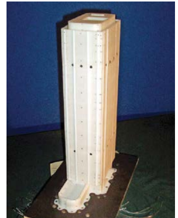
Figure 5: Architectural wind tunnel models are constructed with pressure tap holes to eliminate the time and expense of manual drilling.

Yet, as with all companies, time and cost are key factors in the decision to use FDM. When BLWTL builds architectural models with pressure taps (figure 5), it no longer has to drill them manually. On large models there can be up to 1,000 pressure tap locations, which are time consuming and tedious to drill. BLWTL eliminates this step by incorporating the pressure tap holes directly into the CAD model and building them in the FDM model. Since it uses WaterWorks, the support material is simply washed out of each pressure tap hole. This technique has resulted in up to a 66 percent reduction in the time and labor required to create their wind tunnel models. Overall, BLWTL has seen an average cost savings of approximately 30 percent over their previous methods. With this savings on its wind tunnel models, the laboratory estimates that it has recovered the cost of each of its Fortus systems in only three to five years.