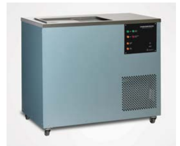
Finishing Touch Smoothing Station by Stratasys.