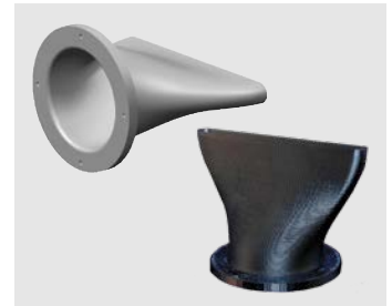
Figure 4: Rear tire blower nozzle for a Joe Gibbs Racing car. CAD model (left), FDM model (right).