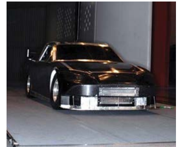
Figure 1: NASCAR teams rely on rolling-floor wind tunnels to analyze aerodynamics of their race cars.

Cars and planes are not the only beneficiaries of wind tunnel testing. This analysis is just as important for stationary structures. In the architectural industry, much consideration is given to the effects of wind on high-rise buildings, bridges and stadiums, especially when they are located in areas prone to extreme weather. A scale model of the structure is attached to a test rig that has surrounding terrain and ground features. The test rig is placed in the tunnel, and measurements are collected. These results are combined with historical data on wind speeds to predict the total load on the structure and the possible effects.