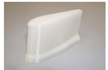
Figure 3: The vertical build orientation of this airfoil produces smoother surfaces that many not need finishing.