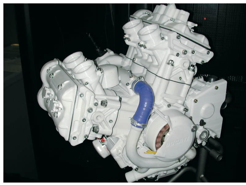
The Desmosedici's engine was prototyped almost entirely from polycarbonate using the FDM process.

By bringing FDM in-house, Ducati cut 20 months from the development process of the engine designed for its Desmosedici race bike. A flagship success for the design team, the Desmosedici engine was designed and assembled in only 8 months. The company's previous engine had taken 28 months to design and build, when the majority of prototypes were outsourced to service bureaus.