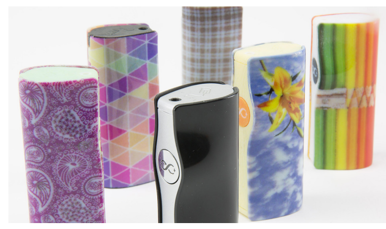
This mobile phone charger sleeve was prototyped with many image options.

So when Synergy redesigned a keypad for an emergency-response system used in the after-market automotive industry, the Stratasys J750 played a key role. The project meant producing multiple designs for the panel, which mounts above the rear-view mirror, to test which would best fit the car's interior and pass ergonomic and mechanical testing. Each iteration included soft-touch buttons, backlighting, graphics, housing and internal connections to the electronic panel.