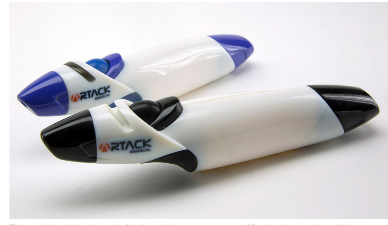
This articulated hernia mesh fixation device prototype was 3D printed complete with logo.