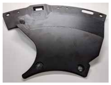
The electro static dissipative qualities of Antero™ (ESD) PEKK material make this part flight-worthy.

"So when Stratasys allowed us access to be a Beta customer for this new material, Antero™ (ESD), we got a material that's strong and capable of being used as a structural polymer that has those ESD qualities that we were looking for," said Kaplun. Antero (ESD) is a Stratasys PEKK-based high-performance polymer with low-outgassing properties and ESD capability. "We've been able to see orders of magnitude savings both in cost and schedule on all of these parts because the part builds are very consistent, the material properties are well understood, and the build parameters are becoming better understood. Also, the properties of the