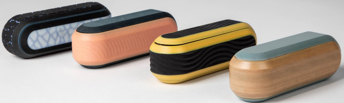
Early CMF Explorations 3D Printed on J55

This workflow has major implications for how the team will approach future projects. Priority Designs uses KeyShot throughout the product design process – it offers a large material library and the renders help communicate ideas to clients. The ability to go from KeyShot render to 3D print with few steps in between saves time and makes it easier to create physical prototypes.