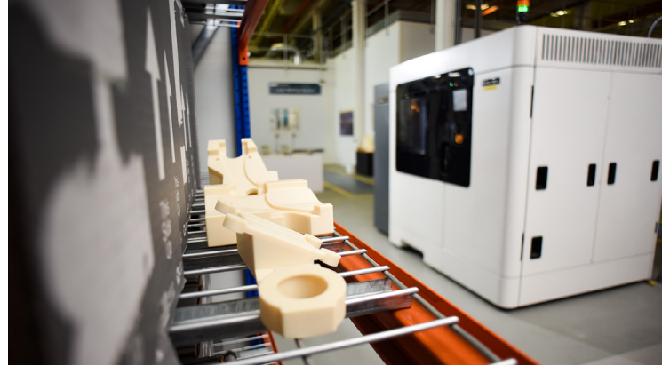
3D printed tooling produced on one of GKN Aerospace's 3D printers.

To achieve these goals GKN relies heavily on its Stratasys Fortus 900mc™ 3D Printer . "The Fortus 900mc offers the largest build size of any FDM® 3D printer, enabling us to quickly produce tools to meet any requirements. We're already utilizing this technology to design and 3D print previously inconceivable tools, which then enable us to manufacture extremely complex parts that would be uneconomical or just physically impossible by any other means," said Trimble.