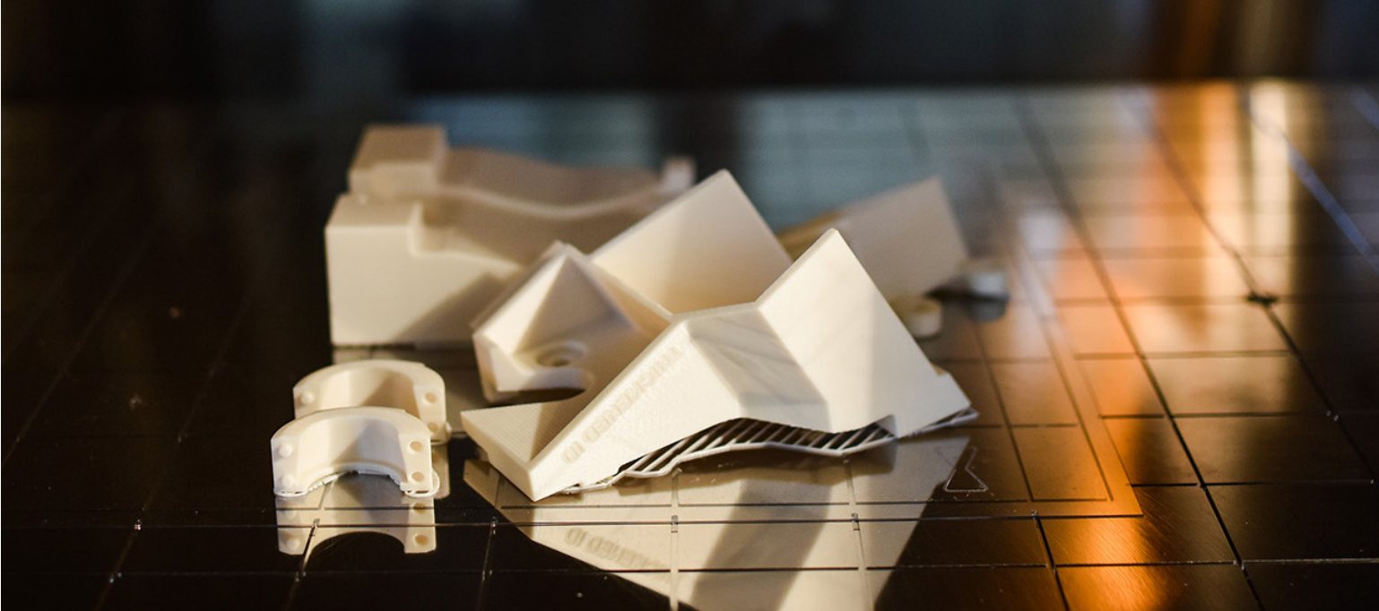
Examples of 3D printed fixtures that are uneconomical or impossible to make with other manufacturing methods.