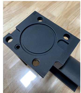
The mounting flange of the part catcher shows the surface finish achievable with FDM Nylon-CF10 material.