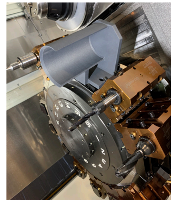
The 3D printed part catcher (gray) is attached to the lathe's lower turret.

3D printing afforded an agile solution that enabled the fast design and manufacture of a turret-mounted catcher. Nylon-CF10 material provided the durability to withstand the lathe's cutting environment, which includes machining fluids. Unlike conventional part catchers, the 3D printed version is smaller and allows full utilization of the lower turret. Additionally, as the catcher drops parts into the chute, the main spindle prepares the bar of raw material for the next cut, increasing efficiency.