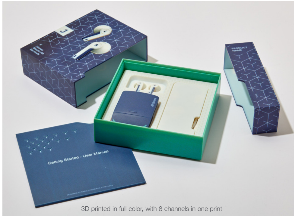
3D printed in full color, with 8 channels in one print

Incorporating full color 3D printing into the design process allows the team to ensure model quality and perfect their ideas in-house. 3D printing also lets designers make concept models, create CMF models sooner and high-fidelity models more often, even when models require full color or multi-material and surface finish.