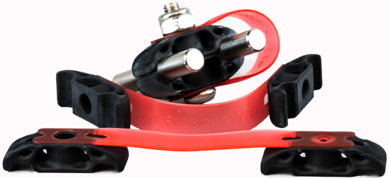
Final clamp revision with a printed-on elastomer tether for ease of installation.