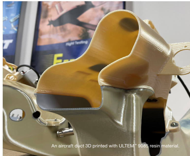
An aircraft duct 3D printed with ULTEM™ 9085 resin material.

That's the reason we go outside for about 75% of our recurring manufacturing, because it allows us to have capacity for the low-volume, one-off, early-stage development work.”