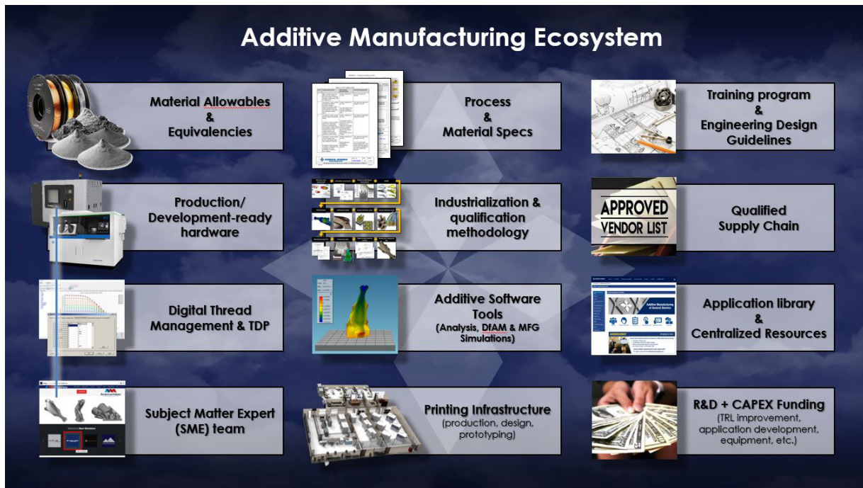
A visual representation of the GA-ASI Additive Manufacturing Ecosystem.