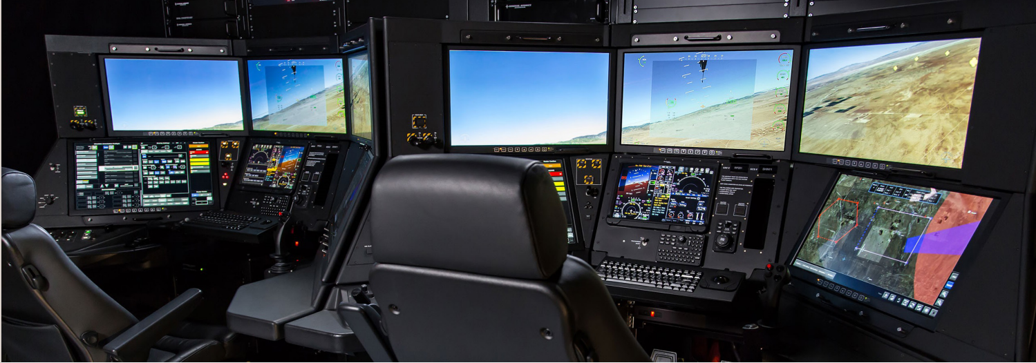
The GA-ASI Certifiable Ground Control Station contains parts previously made with laminated composites that are now 3D printed.

At a higher level, the company has achieved significant cost savings by converting from laminated composite parts to 3D printed alternatives. GA-ASI used AM instead of laminated composites to build elements of its Certifiable Ground Control Station (CGCS), designed for its remotely piloted aircraft systems. Over the initial course of the program, GA-ASI achieved over $2 million in recurring cost reduction in addition to over $300K of tooling savings. A significant portion of these savings resulted from avoided labor to manufacture the tooling and the subsequent lay-up, curing, and final trim work on the composite parts.