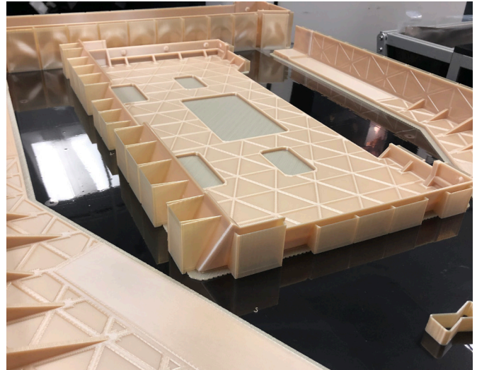
These 3D printed parts replace assemblies that were previously made using a more resource-intensive composite laminate process.