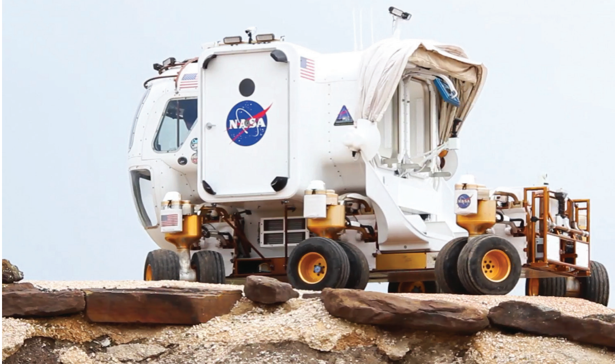
NASA installed 3D printed parts on their Mars rover concept vehicle.