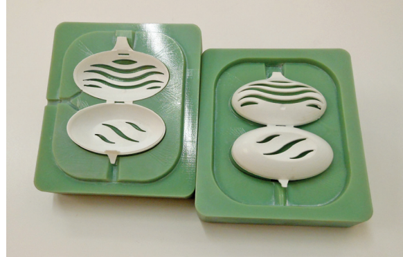
Unilever 3D printed injection mold for Domestos rim block.

The 3D printed replicas offer researchers, scholars and the general public wider access to historic artifacts. Not only can they be restored and recreated, the artifacts can also be used for educational events and traveling exhibitions.