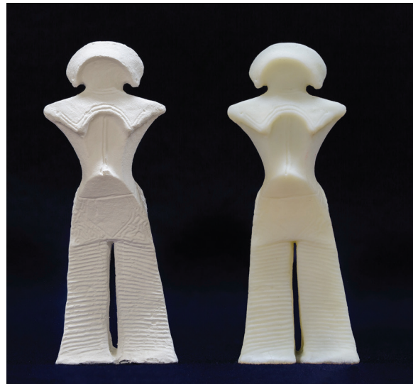
The 3D printed Jomon Goddess sculpture replica (right).