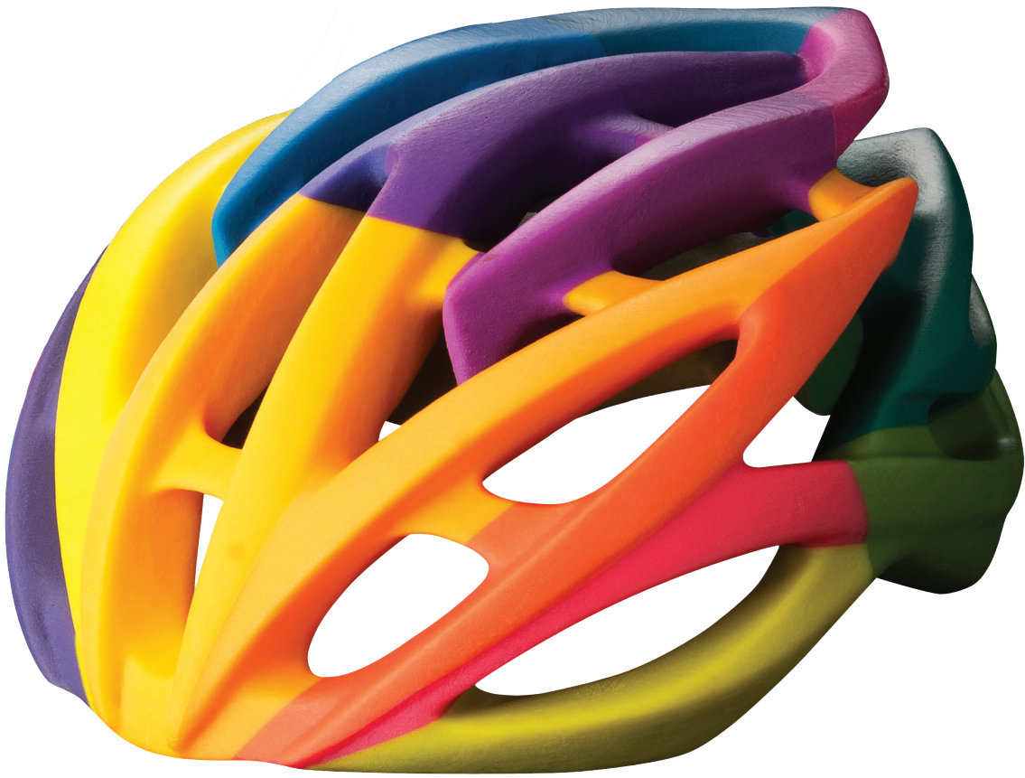
Trek's 3D printed color helmet prototype.

PolyJet technology offers the unique ability to print parts and assemblies made of multiple materials. Parts with different mechanical and physical properties, smooth, durable surfaces and exceptionally fine details are possible, all in a single build. The system can print living hinges, soft-touch parts and overmolds not possible with other technologies. The superior productivity, high quality output and unique multi-material printing capabilities of the Connex printer enable users to closely emulate the look, feel and function of a wide variety of end products. The ability to mix three materials together via PolyJet technology to increase durometers was a key selling point for Trek, as was the ability to combine materials in one part.