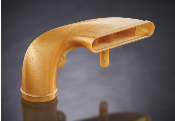
A 3D printed air intake using ULTEM™ 1010 resin.

Airbus, a leading aircraft manufacturer, uses 3D printed parts in place of traditionally manufactured parts to increase supply chain flexibility and meet delivery commitments.